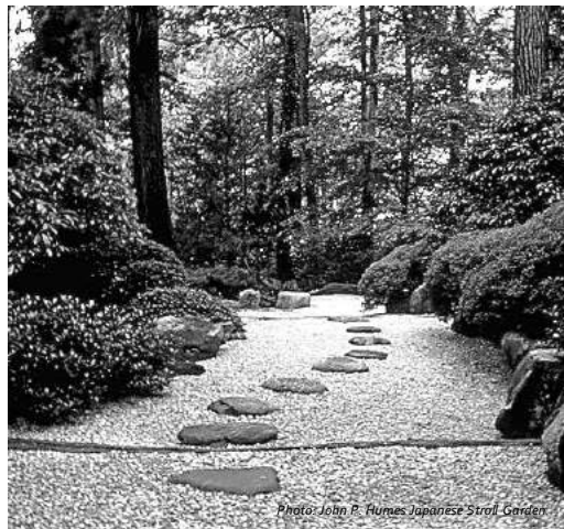
Japanese Stroll Garden

There are over 250 Japanese gardens in North America. We encounter them as havens of beauty and tranquility, as cultural and historic landscapes, and places of natural healing.